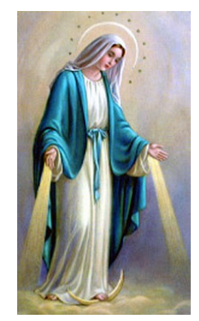
Our Lady of the Immaculate Conception Pray for us!